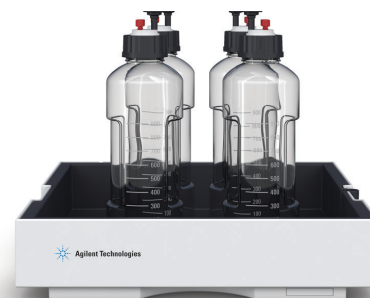
InfinityLab Solvent Cabinet

The new design is compatible with the InfinityLab LC Series, and can be incorporated seamlessly into your LC workflow. These added benefits lead to improved everyday laboratory operational efficiency